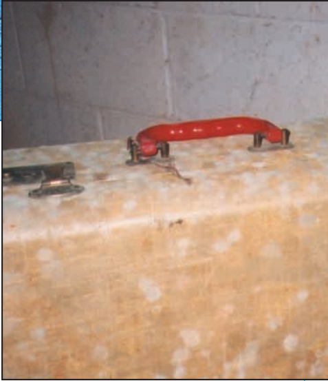
Mold growing on a suitcase stored in a humid basement.

It is important to take precautions to LIMIT YOUR EXPOSURE to mold and mold spores.