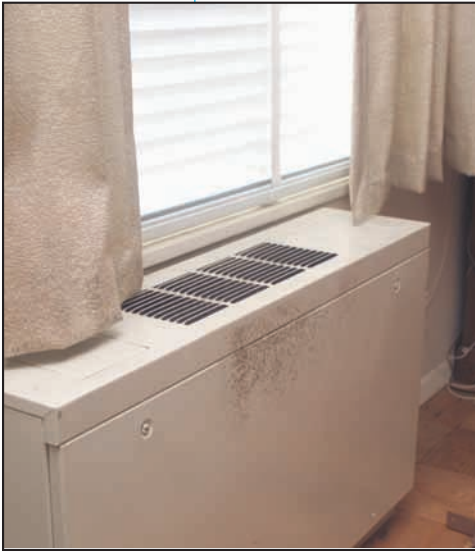
Mold growing on the surface of a unit ventilator.