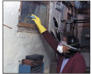
Cleaning while wearing N-95 respirator, gloves, and goggles.