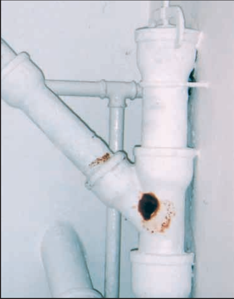
Rust is an indicator that condensation occurs on this drainpipe. The pipe should be insulated to prevent condensation.

Renters: Report all plumbing leaks and moisture problems immediately to your building owner, manager, or superintendent. In cases where persistent water problems are not addressed, you may want to contact local, state, or federal health or housing authorities.