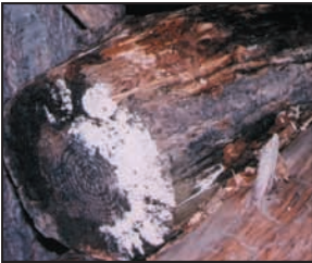
Mold growing outdoors on firewood. Molds come in many colors; both white and black molds are shown here.

Molds are part of the natural environment. Outdoors, molds play a part in nature by breaking down dead organic matter such as fallen leaves and dead trees, but indoors, mold growth should be avoided. Molds reproduce by means of tiny spores; the spores are invisible to the naked eye and float through outdoor and indoor air. Mold may begin growing indoors when mold spores land on surfaces that are wet. There are many types of mold, and none of them will grow without water or moisture.