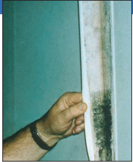
Mold growing on the back side of wallpaper.

Suspicion of hidden mold You may suspect hidden mold if a building smells moldy, but you cannot see the source, or if you know there has been water damage and residents are reporting health problems. Mold may be hidden in places such as the back side of dry wall, wallpaper, or paneling, the top side of ceiling tiles, the underside of carpets and pads, etc. Other possible locations of hidden mold include areas inside walls around pipes (with leaking or condensing pipes), the surface of walls behind furniture (where condensation forms), inside ductwork, and in roof materials above ceiling tiles (due to roof leaks or insufficient insulation).