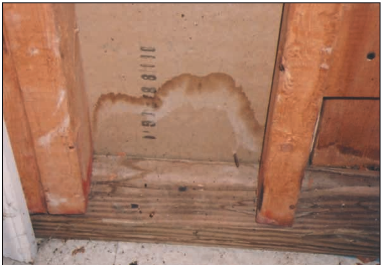
Water stain on a basement wall — locate and fix the source of the water promptly.

Please note: Dead mold may still cause allergic reactions in some people, so it is not enough to simply kill the mold, it must also be removed.