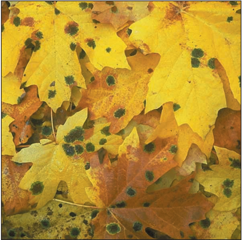
Mold growing on fallen leaves.

This document is available on the Environmental Protection Agency, Indoor Environments Division website at: www.epa.gov/mold