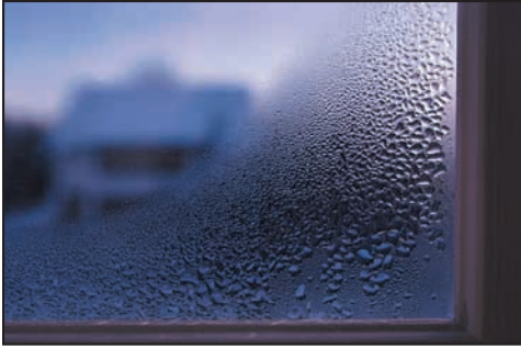
Condensation on the inside of a window-pane.