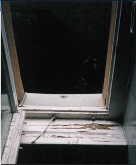
Leaky window – mold is beginning to rot the wooden frame and windowsill.

If you already have a mold problem – ACT QUICKLY.